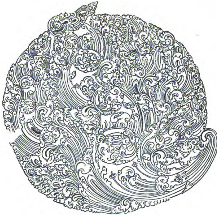
Fig. 3. Tiringi talai (x4).

can be filled with it, though it is typically seen in such places as the tails of birds and mythical animals, especially the tails of the makaras in makara toran . The tiringi talai itself is not a form used in decoration, but is rather a tour de force or test of skill; when the pupil is able to draw a good example (not from a copy, of course), he is considered to be proficient at this sort of work. A few specially good examples have been handed down in craftsmen's families from the late eighteenth and early nineteenth centuries; these, like some working drawings for royal jewellery which I have seen were executed on Dutch paper, which was also used for (the very rare) illuminated manuscripts, of which two good examples were exhibited at the exhibition of Kandyan art in January last. Pattern or copy books ( padimākaḍa pot ) are also used, and I have seen both a modern one, and an early one on Dutch paper, with a cover of paper of Sinhalese make. Old copies were often set also on loose sheets of Dutch or other paper, and not in regular books. The Sinhalese paper was coarse and ill adapted to fine work. Fig. 4 is an example from a modern padimākaḍa pota , the same from which Figs. 1 and 2 are taken. Fig. 3 is from an ancient example.